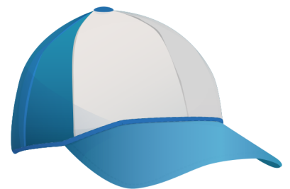
Friend with a Hat